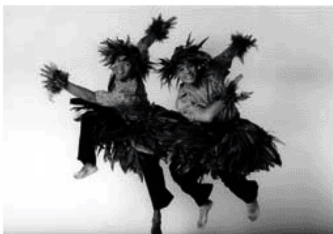
Na Lei Hulu I Ka Wekiu.